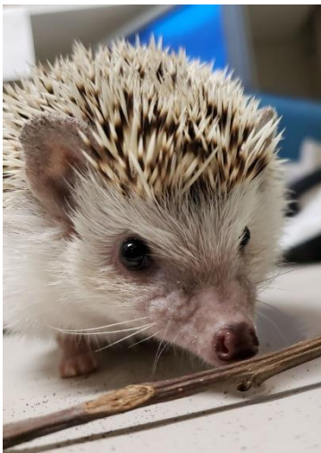
Sol, the hedgehog

To make this cute hedgehog character you will need a pinecone and some clay. Take some tan clay and push it into the front of the pinecone...then try to form it into a bell-like shape as seen in the 2nd picture above. Make 4 oval shapes and stick them on the bottom of the pinecone for the feet. Take black clay and form it into a ball and push it onto the tip of the bell-shaped clay for the hedgehog's nose. Form 2 more black ball shapes for the eyes. Form the smile by drawing it in with a toothpick. Draw in the toes with the toothpick as well. Take some tan clay and form it into a small ball to use as one of the ears...do the same for the other ear. Let dry to harden.